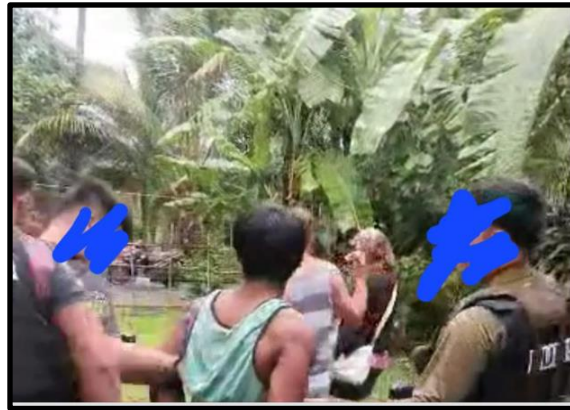
Figure 1. Photo attached to A4

Figure 1 shows police officers arresting the robbery suspect. It can be observed that they are wearing their uniform so readers could easily recognize their identity. The suspect also appears to be in handcuffs. Hence, this photo allows the readers to validate the information in the post.